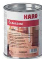
HARO Oil Balm