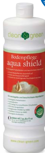
aqua shield floor care for sealed parquet floors and coated surfaces

clean & green aqua shield gives the floor a new brilliance, makes it more robust and protects the surface from damaging moisture.