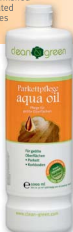
Parquet care aqua oil