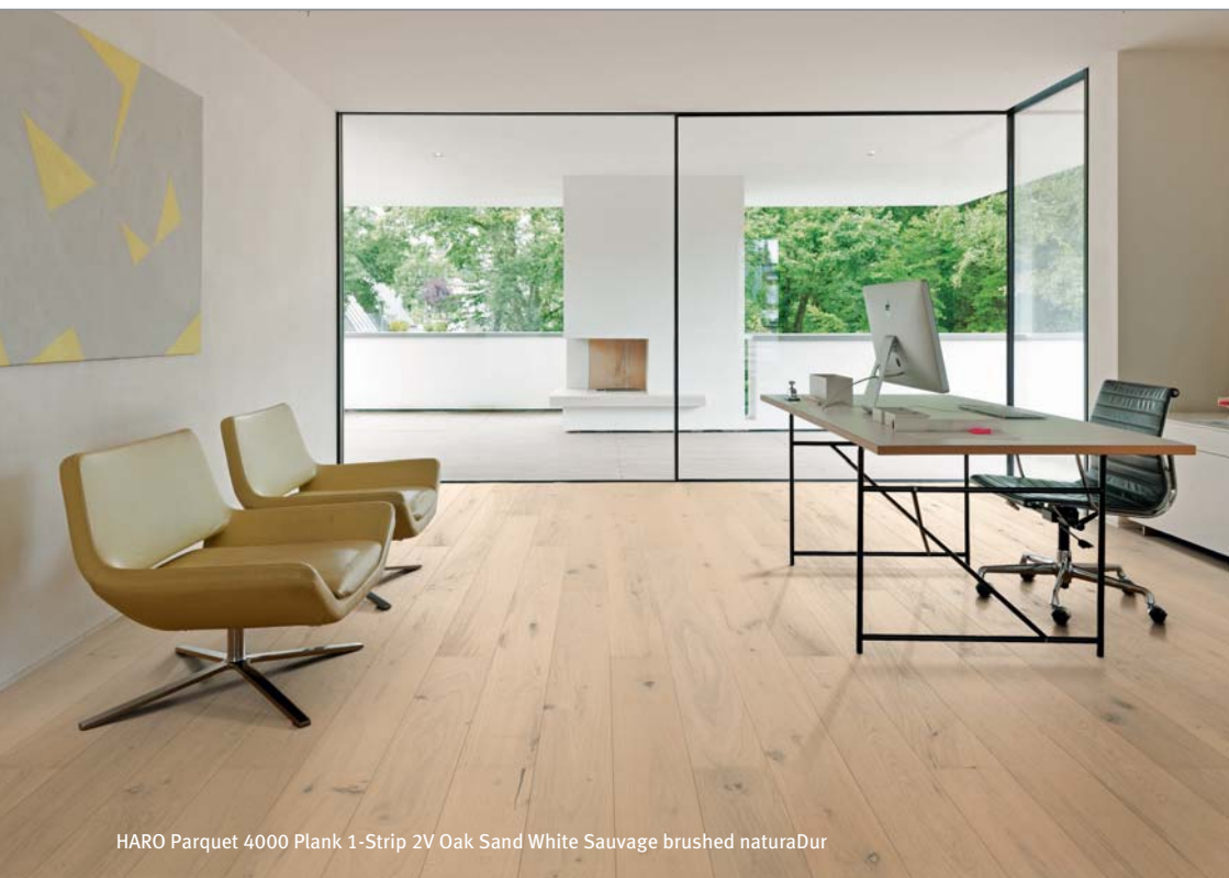
HARO Parquet 4000 Plank 1-Strip 2V Oak Sand White Sauvage brushed naturaDur

Hamberger Flooring GmbH & Co. KG P.O. Box 10 03 53 83003 Rosenheim Germany