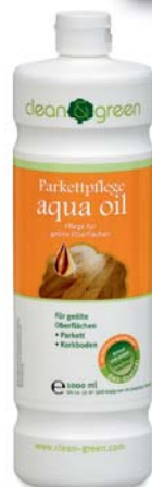
aqua oil parquet care

We recommend using aqua oil black for refreshing/touching up oiled black parquet exposed to high wear and tear. For white oiled parquet, we recommend aqua oil white.